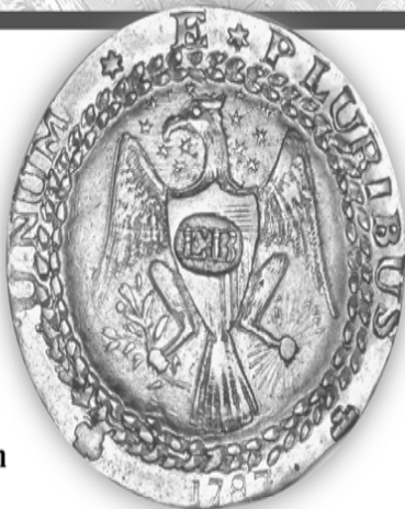
Unique 1787 "EB" on breast Brasher Doubloon from the Gold Rush Collection